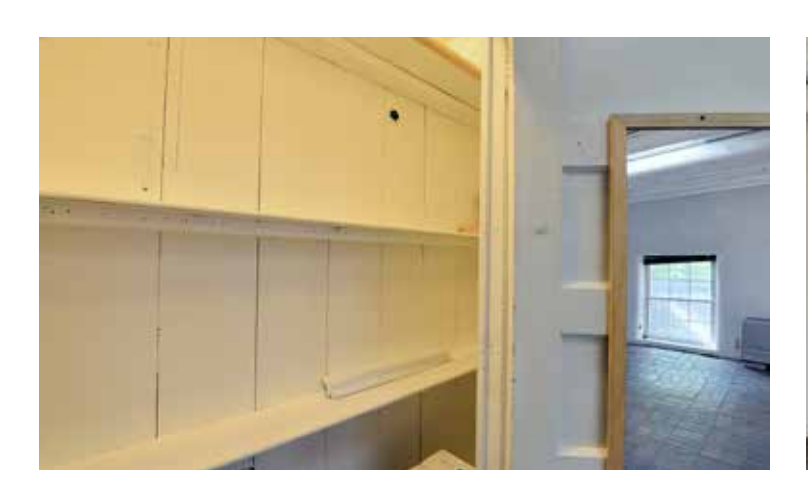
⇔ Brick Floors ⇔ Mexican Tile