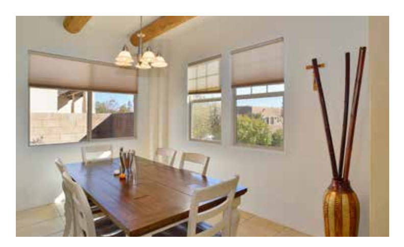
↔ Open Design ↔ Kitchen Center Island ↔ Formal Dining Room