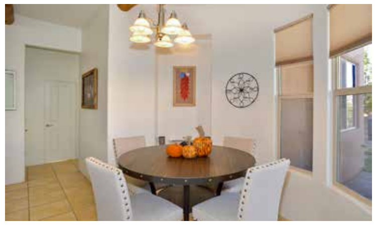
LIVING & DINING