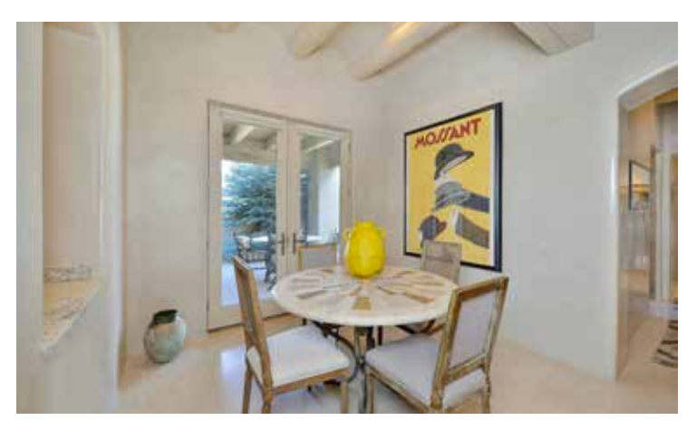
LIVING & DINING