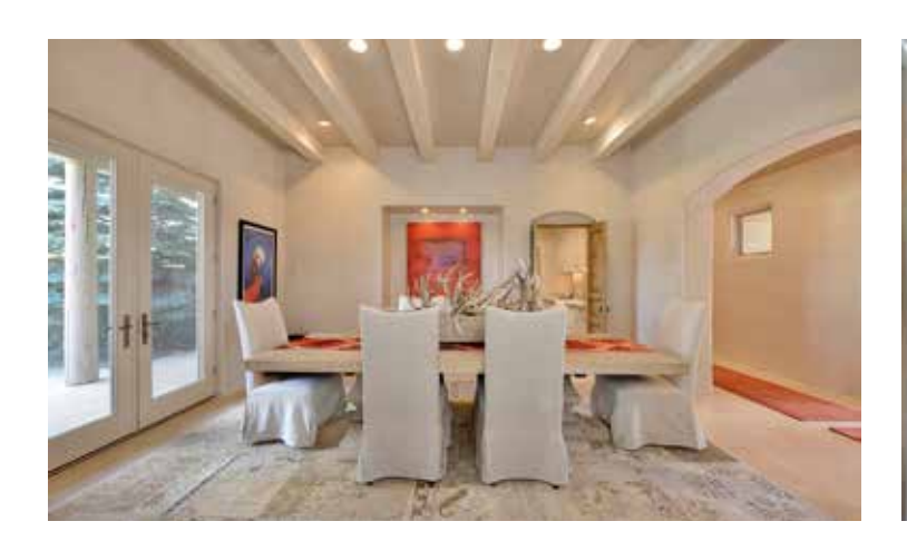
◆ Limestone Flooring ◆ Formal Dining Room ◆ Gourmet Kitchen