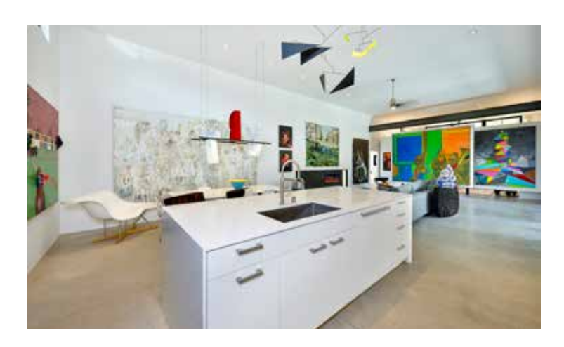
↔ Light-Filled ↔ Open Floor Plan ↔ Clerestory Windows