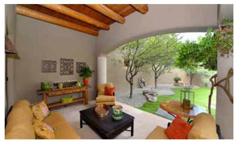
DINING AND ENTERTAINING

↔ Spacious Gourmet Kitchen ↔ Kiva Fireplaces ↔ Grand Fireplace