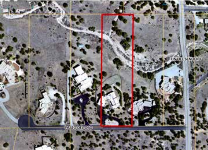
7 PASEO DEL OSO - PLAT This depiction is for illustration purposes and may not be entirely accurate

3 Bedroom • 3 1/2 Bath • 3310 SF • $1,000,000 • MLS# 202002172