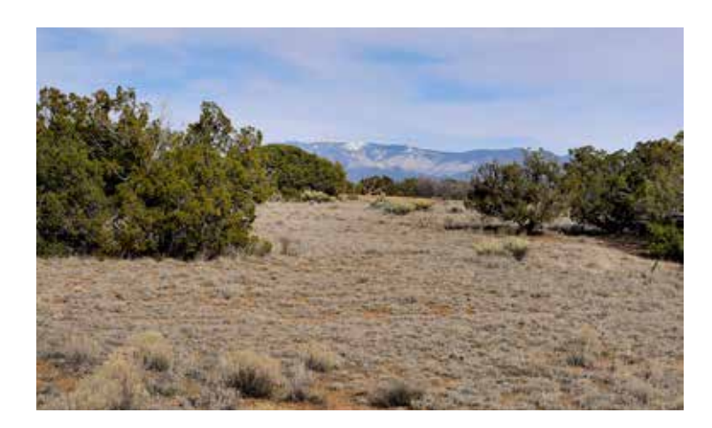
Gated Community Spectacular Mountain Views