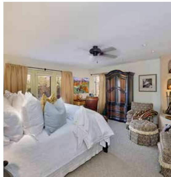
688 LA VIVEZA - PLAT This depiction is for illustration purposes and may not be entirely accurate