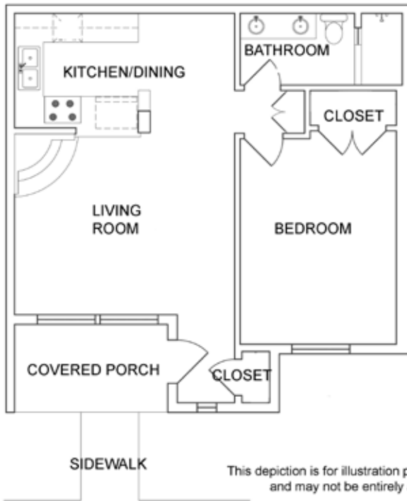
320 ARTIST RD UNIT 12 FLOOR PLAN

This depiction is for illustration purposes and may not be entirely accurate