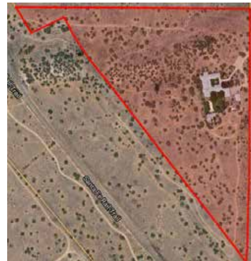
This depiction is for illustration purposes and may not be entirely accurate