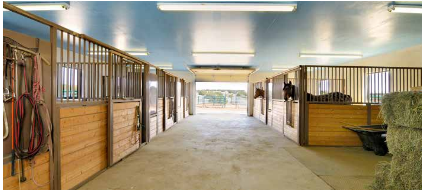
44 & 34 TRES CIENTOS PLAT

5 Bedroom / 5 Bath / 5721 SF • $1,709,000 • MLS# 201802355